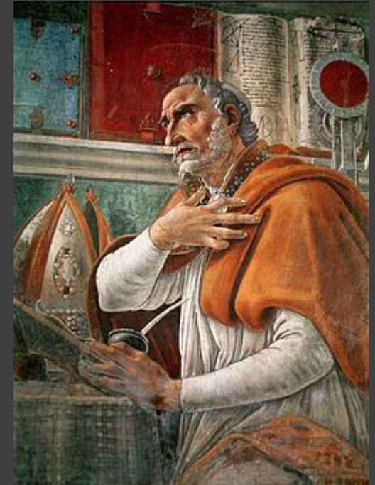
Sandro Botticelli, 1480